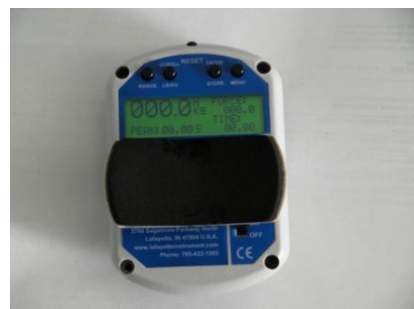
Fig. (1): Lafayette Manual Muscle Test System (Model 01163, Lafayette Instrument Company, Lafayette, Indiana, USA).

Ultrasound. It was used in both of the study group A and the control group B.