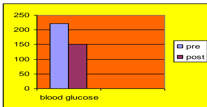
Fig. (2): Comparison between the mean values of the pre and post treatment blood glucose level.

The results of the present study had also showed a significant increase in the indices of the treadmill test that represent the improvement of the aerobic fitness or capacity by aerobic exercise training for 3 months, as it produced significant increase in the VO_2 max, AT, and the MTT ( P < 0.05 ). In the bivariate correlation analysis only the reduction in the fat body weight was significantly correlated with the maximum oxygen consumption,