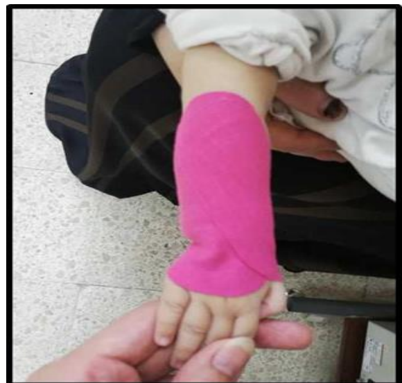
Figure (2): Kinesio Tape application

Another piece of tape was applied from the common extensor origin to metacarpophalangeal of thumb to form Y shape with other tape.