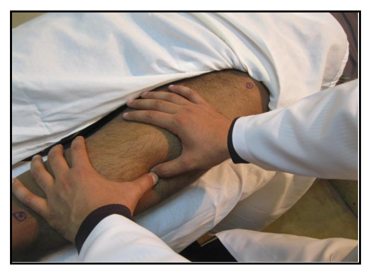
Figure (2): Manual ischemic compression technique on TrP.

a) Manual ischemic compression technique: It was done for participants in group (A) by applying digital pressure (one thumb on the other) to every trigger points for 15 seconds and started with light firm pressure and gradually increased it till reaching the patient's maximum pain tolerance (as shown in figure 2). This procedure was repeated 3 to 5 times on each trigger point (Hains, 2002).