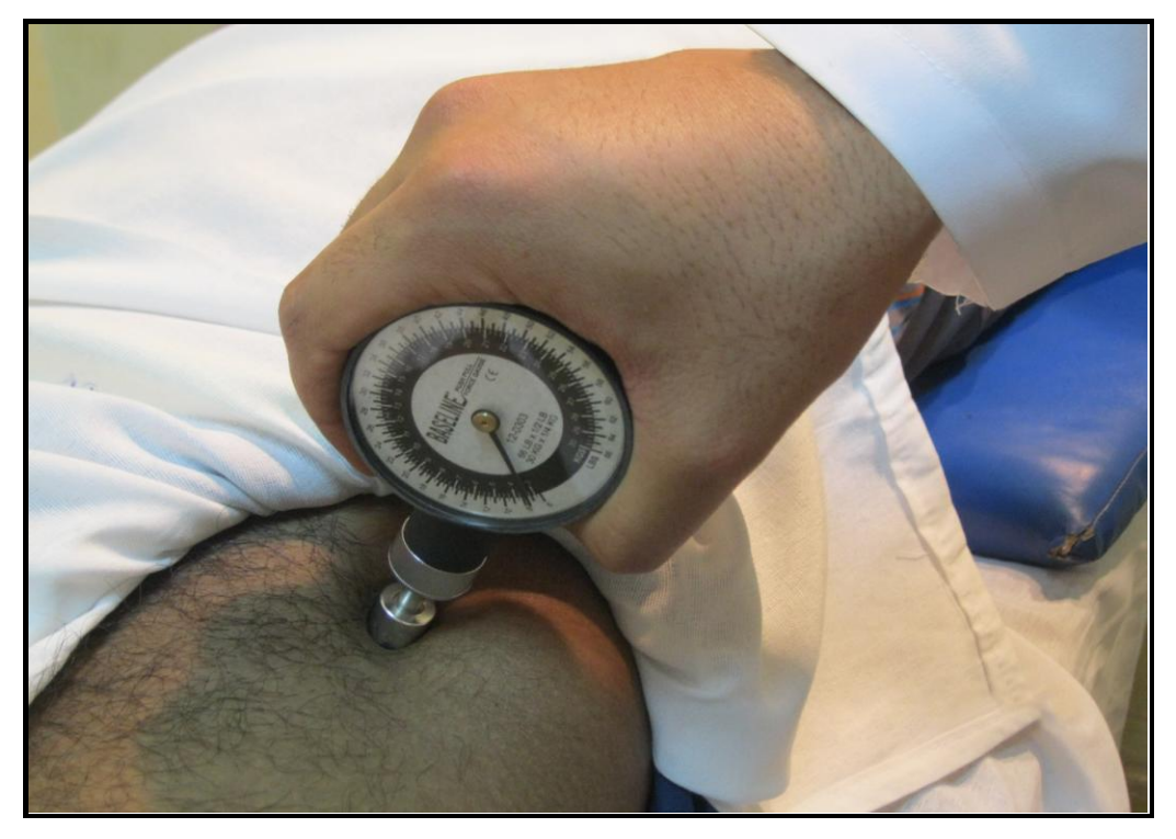
Figure (1): Measurement of level of tenderness of trigger points by pressure algometer.

The specific location of the trigger point within the four muscles, which constitute the QF, was determined and noted by permanent marker as indicated by Chaitow and DeLany (2002) as follow: